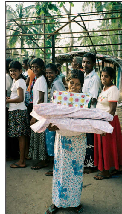
Top: The aid arrives in Sri Lanka Below: Sewing group with new machine

Edinburgh Direct Aid continue to help victims of the tsunami. For more information, or to make a donation contact EDA on 0131 552 1545, or email: www.edinburghdirectaid.org