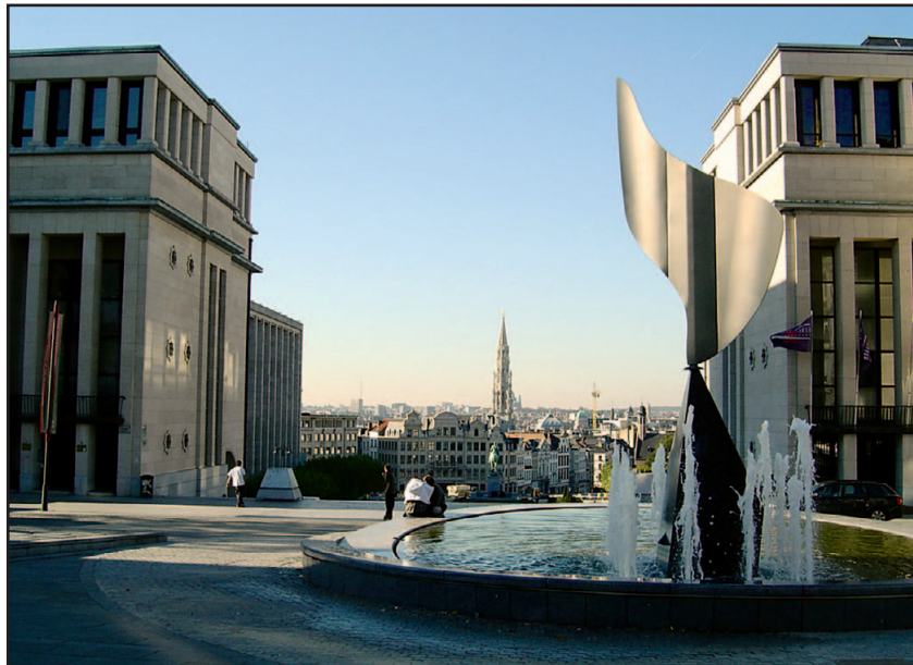
Delegates travelled to Brussels (above & below) for the conference

"The people were nice, and it has been a success," she concluded.